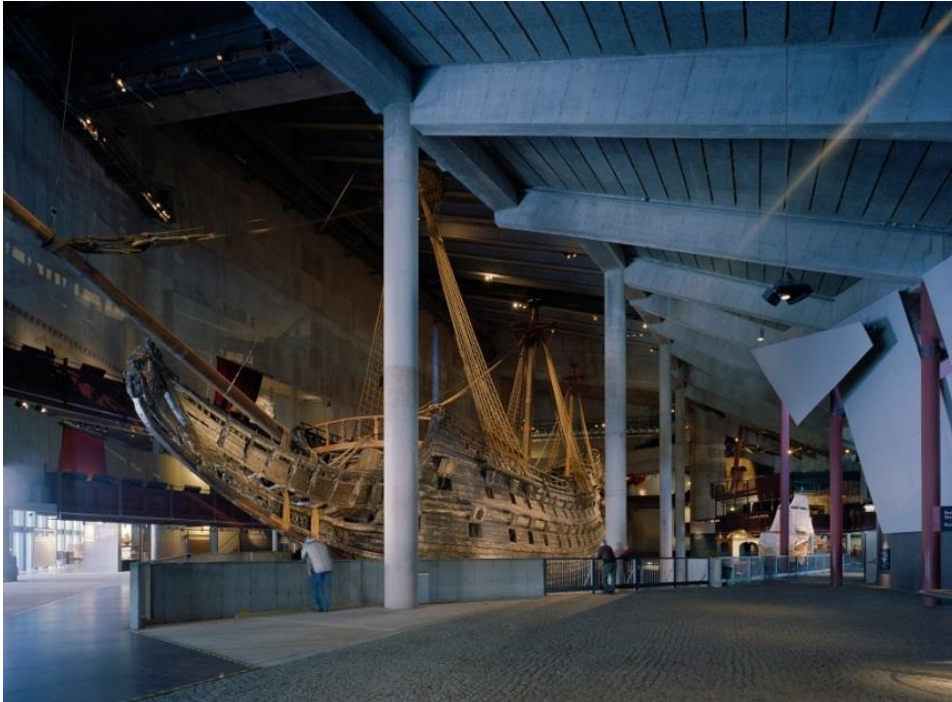
The 17 th -century warship Wasa; the Wasa Museum, Stockholm